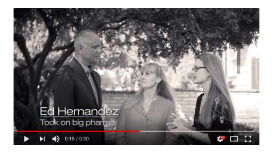
To view Senator Hernandez' "Record of Progress," digital video ad, <u>click here</u> or on the screen shot below.